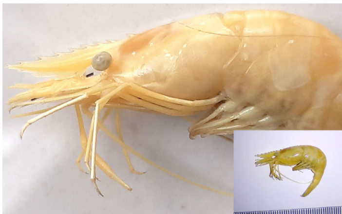
Fig. 2. Photograph of Palaemon longirostris H. Milne Edwards, 1837, female (preserved in alcohol).

Fig. 2. Fotografia de Palaemon longirostris H. Milne Edwards, 1837, hembra (ejemplar conservado en alcohol).